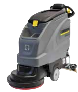
B 40 W with D 51 head