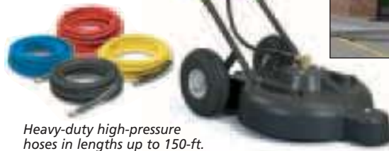
Heavy-duty high-pressure hoses in lengths up to 150-ft.

Telescoping wands extend to 24' to reach high places without scaffolding