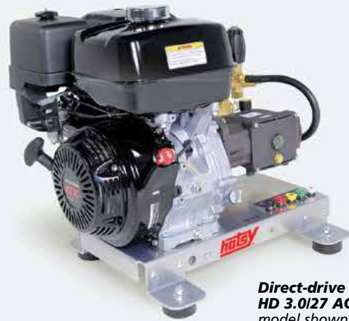
Direct-drive HD 3.0I27 AG model shown as skid