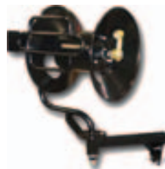
360° Pivot and non-pivot hose reels keep hose neatly stored and shop areas safe